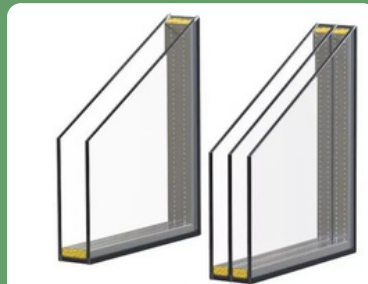
Double Pane vs. Triple Pane Windows

Remove vegetation or combustible items away from your windows.